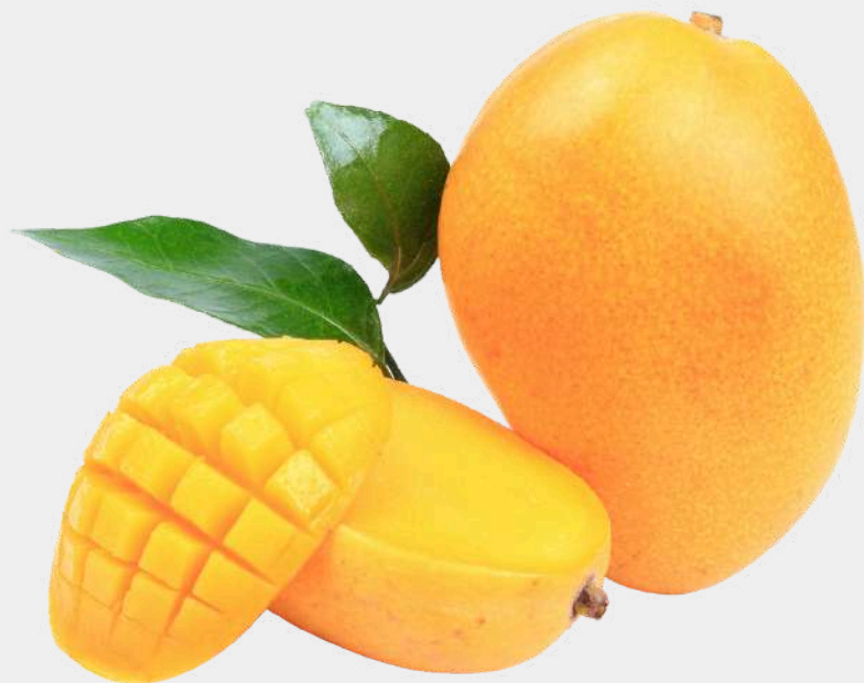
Mango Pulp/ Concentrate