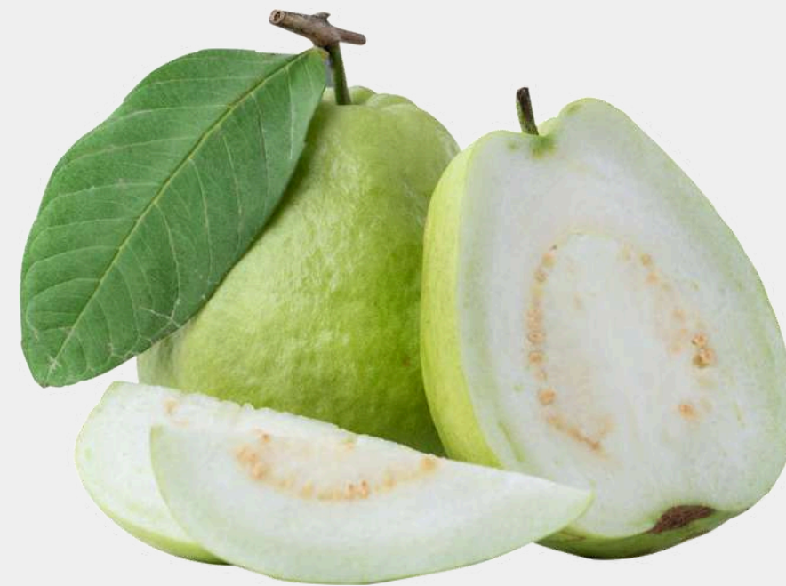
Guava Pulp/ Concentrate